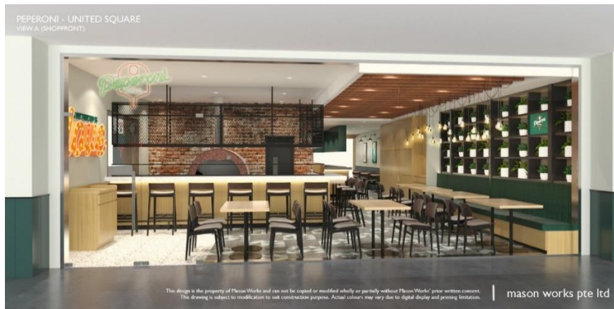
Rendered Image of Peperoni United Square Storefront

Cos' everyone kneads some Peperoni Pizzeria in their life