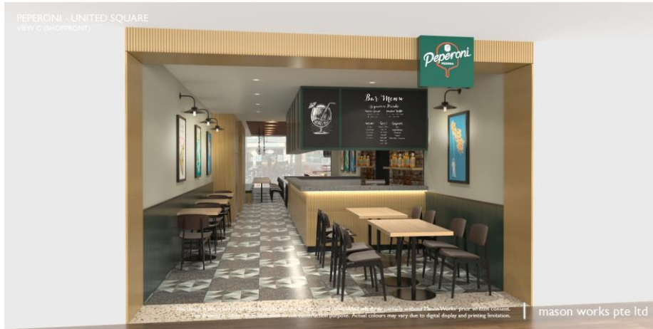
Rendered Image of Peperoni United Square Mall Entrance

Decked in modern Scandinavian minimalist furniture and materials, Peperoni United Square maintains the warmth and comfort of a traditional Italian trattoria — thanks to its bare brick wall and exposed wood oven. Peperoni United Square sits up to 50 people (with social distancing). Guests can enter from either of the store’s two entrances, one located within the mall and the other outside the mall.